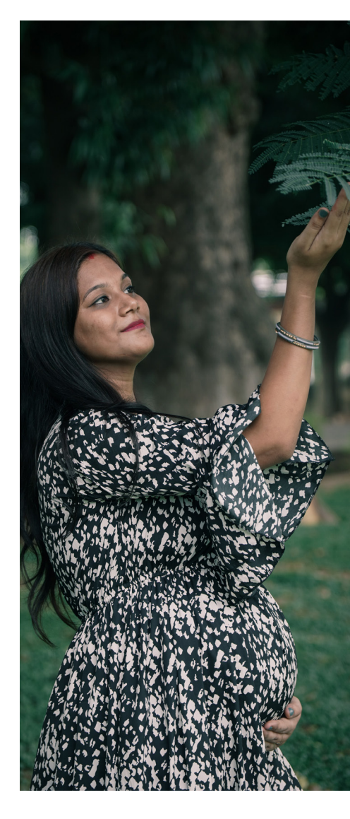
The image depicted contains models and is being used for illustrative purposes only.